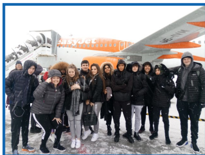
Students arrive in a snowy Poland.